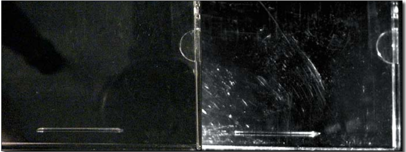
UV Imaging (UV camera and light source in a dark-field viewing mode) detecting scratches on a CD jewel case.