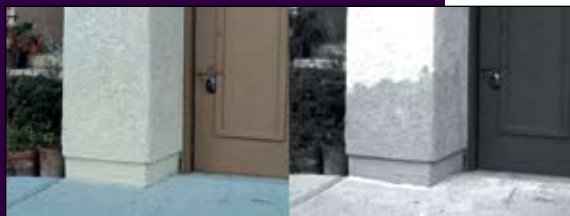
UV imaging in sunlight showing the application of fresh paint that was undetectable to the eye.

Unfortunately, this method suffers from serious limitations related to composition, exposure control and focus. These limitations stem from the visible-light opacity of the UV pass filter combined with the inability of the eye to see UV light through the viewfinder, as well as the fact that light meters (whether external or in cameras) are not designed to measure UV light levels.